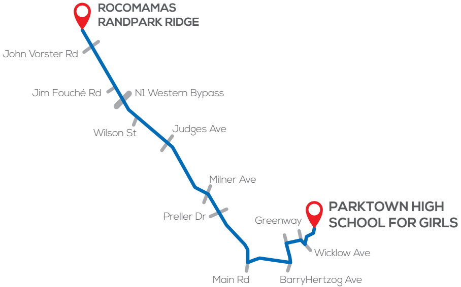
Table 1: Drop-off points and departure times for the Beyers Naude route