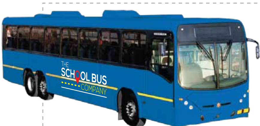
Figure 1. Volvo B9R 6x2 rear engine bus.

For more information visit www.marcopolo.com.br/marcopolo_sa/en/marcopolo/empresas